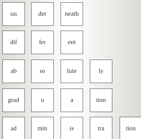
Figure 3. Manipulating Syllables on Individual Cards to Arrange Them Into Words

ency, and comprehension can all be addressed in the lesson.